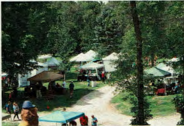
Art Fair Venue

Proceeds from the Richfield Art at the Mill will go toward Richfield Historical Society projects - in particular, the restoration of the Messer/Mayer Mill to "Get It Grinding." Thank you to the many exhibitors, attendees, and volunteers who made the 2018 Art at the Mill a success.