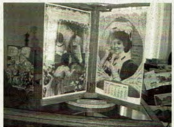
Early 1900s Calendar Display at LWC

In addition to the map project, Norb designed and built a rotating display which features early 1900s calendars. A lot of hard work and time went into both of these projects.