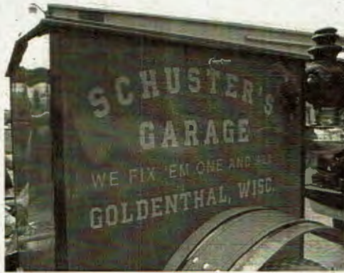
Schuster's Garage – Goldenthal, Wisconsin