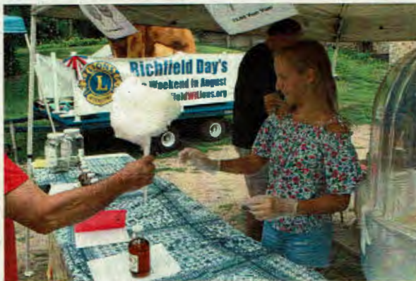
Maple Cotton Candy Treat