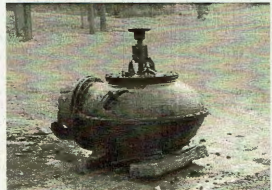
The Water Turbine

Our next major project will be the reconstruction of the Engine Shed on the south side of the Mill. This will begin in 2019. It will house our restored Superior Engine which we have had outside near the Mill for several years.