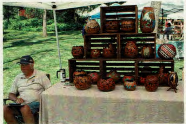
Fine Craft Display