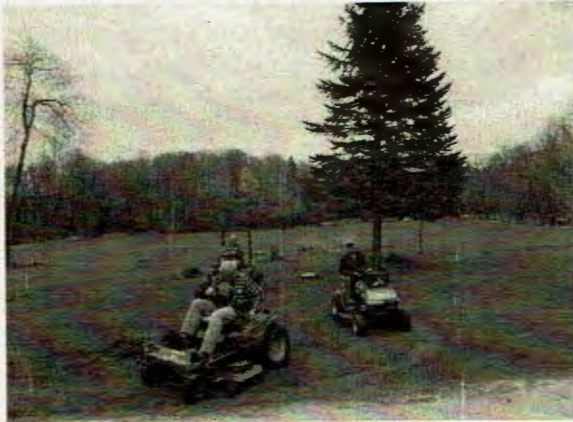
The Lawn Crew

As custodians, we feel we have a duty to leave the Historical Park better than we find it. I believe we are doing just that.