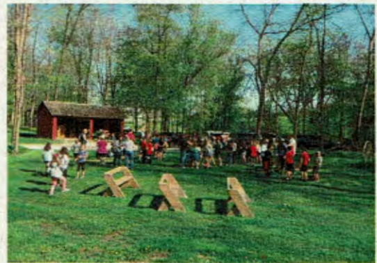
A Day at the Park

The Historical Society's two education days were held this year on May 17 and May 23. The weather gods were shining down on us as the weather was absolutely perfect both days. Our talented volunteers were able to accommodate the very nice increase in participants – 193 students plus teachers and chaperones. This was the largest number of third graders to enjoy the day-long field trip at our beautiful historical park since we began this outing several years ago. Twenty-eight volunteers contributed over 300 hours, and again we heard many favorable comments as the youngsters were boarding the buses to return to their schools.