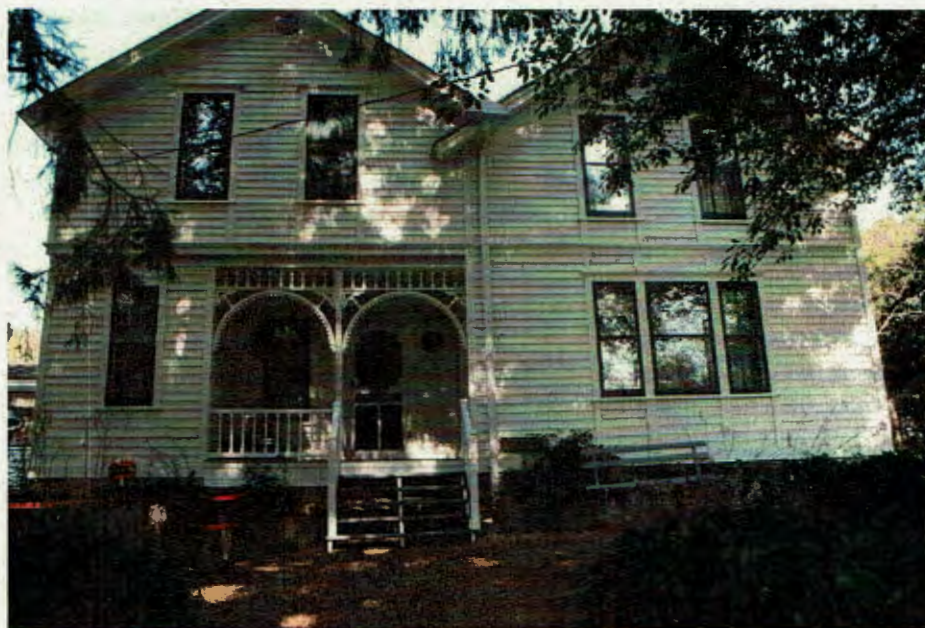
The Mill House